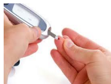
Blood glucose monitor

Diabetes is not curable, however it can be treated. Treatment is aimed at maintaining normal blood glucose levels. For both type 1 and type 2 diabetes sufferers, eating a diabetic diet low in sugar is essential, as well as taking regular exercise and maintaining a weight within the range recommended for age and height. Type 1 diabetics must measure their blood glucose levels during the day with a blood glucose monitor and take insulin by a small injection just under the skin as required. The injection is usually self administered into the fatty tissue around the stomach or thigh, up to six times a day. Some chose to have an insulin pump which has an automated infusion process. This can be useful for children with type 1 diabetes. Pre-diabetics and some type 2 diabetics can control their diabetes by diet in the early stages. However as the diabetes progresses, this is not enough to control blood glucose levels so medication is recommended which is not insulin, however it acts to assist the body in controlling blood glucose levels. Eventually several types of medication and insulin may be required.