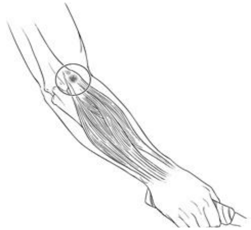
Location of pain with lateral epicondylitis

If the condition has not cleared up after six to twelve months, surgery may be recommended by an orthopaedic surgeon. This will involve the Surgeon removing the damaged tissue and reattaching good muscle to bone. The arm is then splinted for a week and then gradually, rehabilitation exercises can begin. Full recovery will take approximately six months depending on the patient.